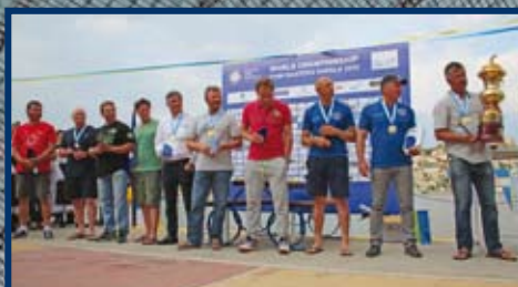
GREEK FINN WORLD MASTERS