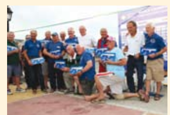
18 Legends took part

After a two hour delay to wait for the sea breeze to fill in, two more races were sailed in a building breeze that topped out at about 10-12 knots in the second race, while in the first it remained light and patchy. The second race produced simply superb sailing conditions with great waves for the downwind legs so everyone had a great time, wherever they were in the fleet. It doesn't get much better for Finn sailors than surfing downwind in a solid breeze in 28 degrees and brilliant sunshine.