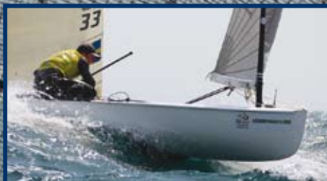
WORLD CUP ROUND-UP