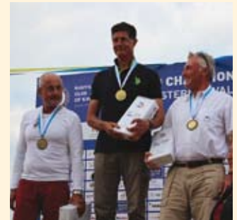
Grand Grand Masters: 1 Francesco Cinque ITA 5 2 Antal Gabor HUN 4 3 Uwe Bartel GER 62