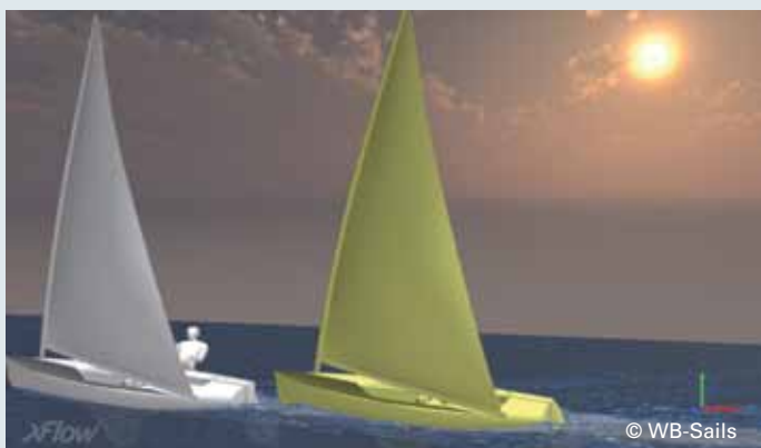
Figure 3b: If it wasn't for the backwinding, the boat behind would easily catch the one in front.

The nature of these simulations is more qualitative than quantitative. This is partly due to our limited resources, both computationally and time-wise, but also because the underwater influence, on the performance of nearby boats, is small. The thing to remember would be that boats push the sea in front of them, and drag it behind them, in remarkable quantities.