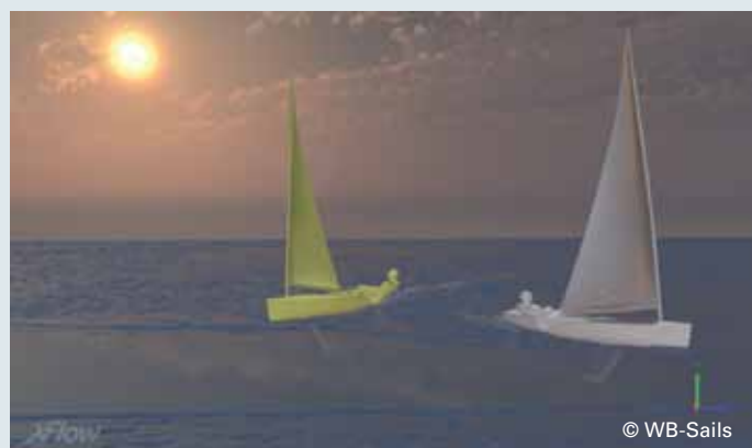
Figure 4a: Lastly, let's take a look at a case where the two boats are crossing each other on opposite tacks. Here, no significant difference between the white starboard-boat and the yellow port-boat can be seen. There is some interaction, mostly when the port boat is crossing the wake of the starboard boat, but overall the differences tend to cancel each other. So with the crossing boats, the interaction in the air is dominating: In our earlier simulation we could see, that the port boat is gaining up to 70 cm for each stern taken when crossing behind starboard boats.