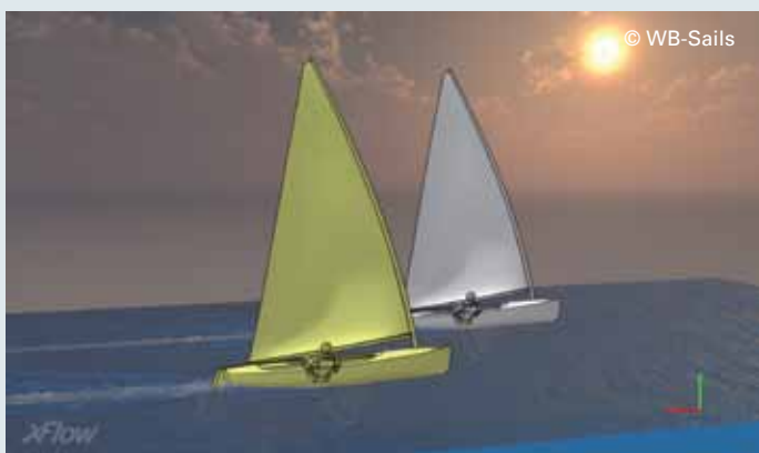
Figure 2: In the second session, the white boat is in the "safe leeward position", with the yellow boat on its windward hip, one boat length behind and higher. This time, the windward boat would be gaining at a rate of 6 cm per minute, unless it was for his lousy position on the aerodynamic map. In all, the leeward boat still has the advantage.