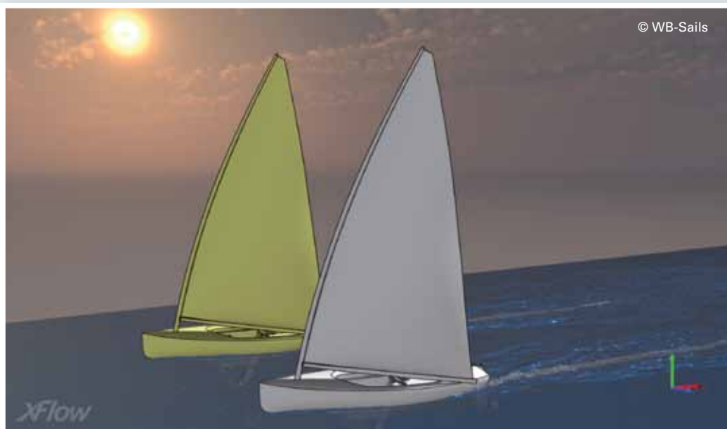
Figure 1: In the first session, we have two boats sailing side by side, bows even, at one boat length distance from each other. Given that the sail forces are similar, the leeward boat (white) is gaining at a rate of 2,5 cm/10 seconds or 14 cm per minute. In our air-simulation the windward boat had a tiny advantage 89% vs 88%, so with the underwater loss, we score this situation deuce, in tennis terms.

Also keep in mind, that these simulations only take into account the underwater effects, except for the comments referring to the in the air-simulation we did earlier. A simultaneous, two phases simulation air/water would be possible with the existing software but would be computationally extremely costly.