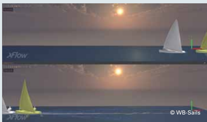
Figure 3a: In the third session, we have the yellow boat starting half a boat length behind the white one, precisely in its wake.

This is the case where the boat behind can exploit at full the water being dragged along by the boat in front. In 10 seconds, the boat behind would catch the one in front - if it wasn't for the backwind he gets from his frontrunner's sail. In this simulation, like in all these presented here, the sail forces on both boats are exactly equal. From the November 2018 issue, you can read that at one boat length's distance, the sail efficiency is down by 30%, so upwind you don't hit the transom of the boat in front of you just like that. But downwind the case is different: Your sail performance is not marred, and you enjoy a favourable current of nearly two knots. A downwind study, with the boat behind crossing from the leeward side to the windward side, would be a worthwhile future project.