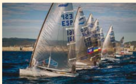
Above: Christmas Race. Top: Vasilij Zbogor.