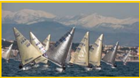
LOBERT WINS IN CANNES