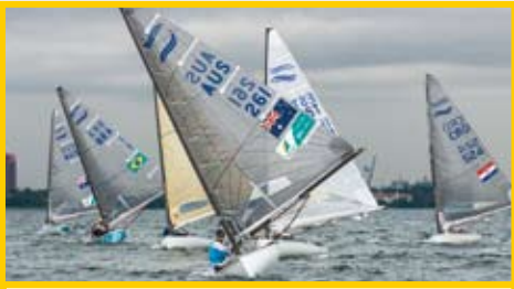
MELBOURNE & MIAMI