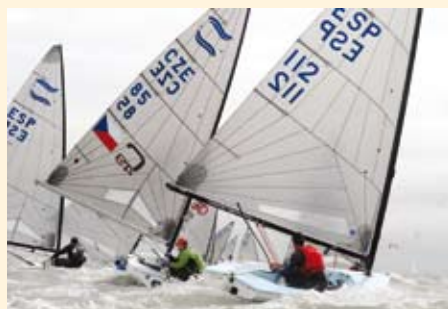
Below: Andalusian Olympic Week.